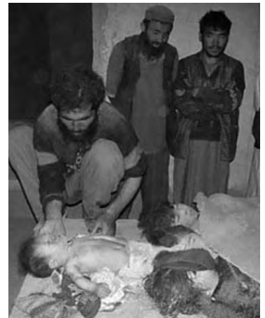
Killed by New Labour bombs

Every vote for Labour this May will be presented by Labour as a vote of support for their foreign policy... please do not reward them.