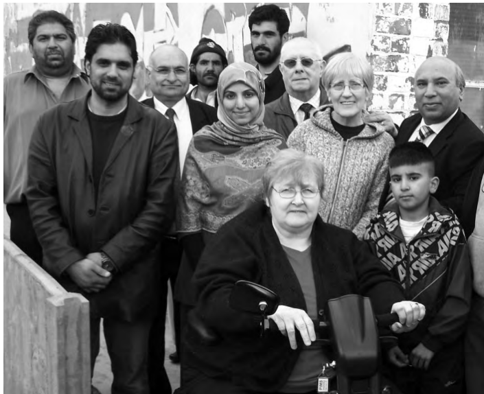
Top: Partnership brings success. Bottom: New passageway

Your local Respect councillors were recently alerted to the problem of disability access in the Balsall Heath area. Through a combination of council funding and generous neighbours, the money was raised to finally provide a new passageway to allow disabled residents easier access to their homes.